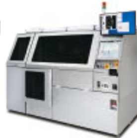
High accuracy bonder for advanced packages