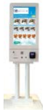
Cashless payment ticket vending machine