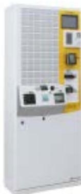
Multiple payment ticket vending machine (Push button type)

At Shibaura Vending Machine Corporation, we undertake the development, manufacture, sales and service of a wide range of vending machines compatible with numerous electronic payment systems, including credit cards and electronic money.