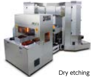
Dry etching equipment for photomask (ARES)