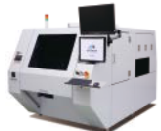
High performance bonder for fan-out panel level package