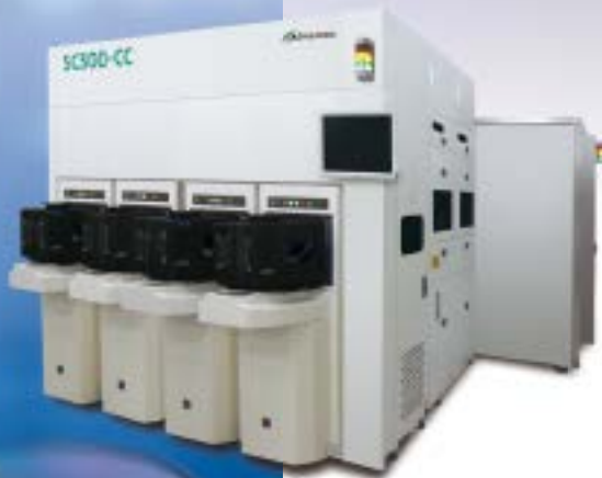
Wafer wet cleaning equipment

We continue to push forward the development of equipment that reflects miniaturization of semiconductor devices. We also develop new technologies that strike a balance between high productivity and economic efficiency in respect of providing eco-friendly products. From the front-end process through to the back-end, our goal is to meet diverse customer needs with specialized equipment.