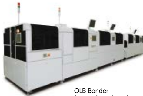
OLB Bonder for small- and medium-sized displays