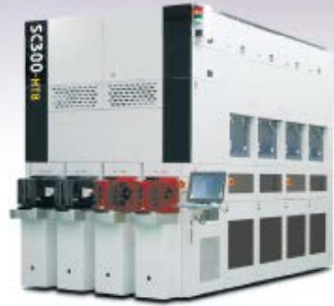
Single wafer wet processor for high temperature chemical