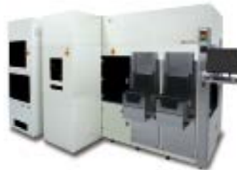
Wet cleaning equipment for photomask