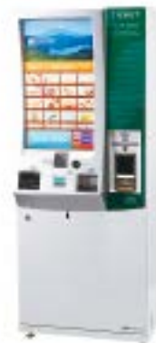
Ticket vending machine (Touch panel type)