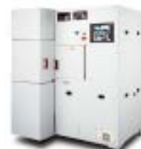
Sputtering equipment for research and development