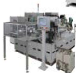
Sputtering equipment for optical components