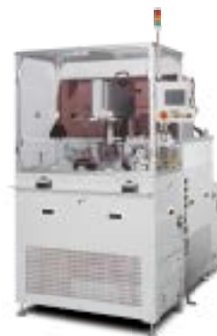
Sputtering equipment for electronic/automotive components

We are achieving high productivity and space reductions with the high speed, single wafer sputtering technology we have developed over many years. We are introducing sputtering equipment in a wide range of markets, including automotive devices, electronic components, and displays, including those for smartphones and tablets.