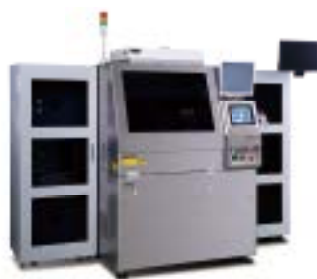
Flip chip bonder for display driver