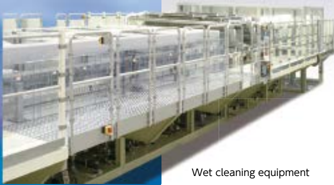
Wet cleaning equipment